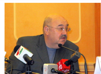
Anatoliy Vorokhayevev, First Deputy Odesa Mayor: "The Ukrainian economy's transition to the innovative development type determines fundamentally new requirements for the system of strategic planning and coordination of actions between local government and businesses"

Opening the meeting, First Deputy Odesa Mayor Anatoliy Vorokhayevev said Odesa is the first Ukrainian city with population above one million to participate in the project. He pointed out that the strategic planning technology applied by LINC has been already implemented for drafting local