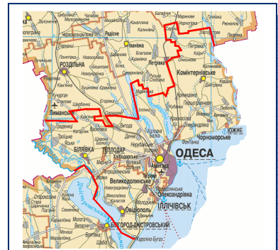
For the purposes of LINC, the Odesa agglomeration is the economic sub-region comprising the cities of Odesa, Teplodar and Yuzhne, and the raions of Bilyaivka, Kominternivske and Ovidiopol