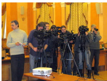
The event in the Odesa City Hall attracted close attention from the media

Five days later, in the Odesa City Hall, the signing ceremony and the introductory meeting of the Odesa city EC followed more or less the same pattern, except that the event attracted more attention from the media.