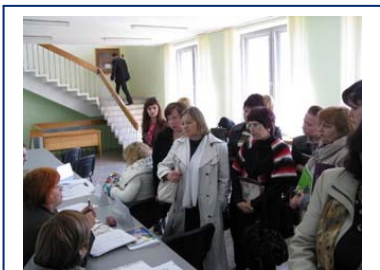
How does it work? Crimean guests interrogate their Kherson counterparts