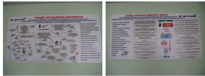
Two posters in the Kherson Permit Center illustrating the permit-issuing procedures: how it was and how it is now