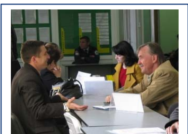
A good sign – the smiling client in the Permit Center