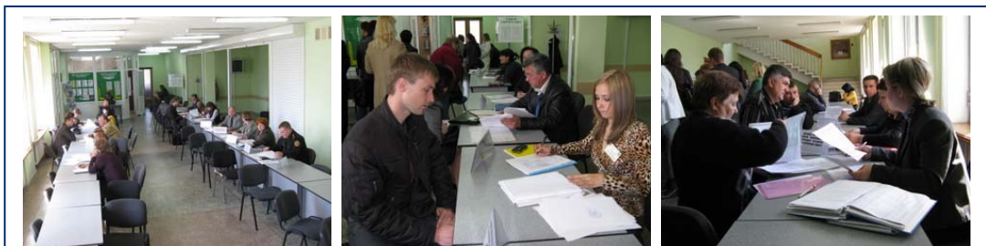
The Kherson Permit Center in action. Eighteen institutions issuing a total of 55 permit types are represented in the one-stop shop. In 2009, the center processed over 3,000 applications from clients including visitors who came for an advice, and issued more than 1,700 permits