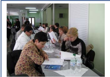
Study tour participants read handouts provided by USAID LINC

acquired during the study tour and advice from USAID LINC experts, the Kerch government is taking measures to ensure that permits will be issued exclusively within their one-stop shop, which is expected to increase its performance drastically. USAID LINC also provides methodological assistance and consultation in the making of permit centers in Crimean cities or raions of Armyansk, Bakhchysaray, Bilohirsk, Dzhankoy, Feodosia, Krasnoperekopsk, Lenine, Saky, Simferopol, and Yevpatoria.