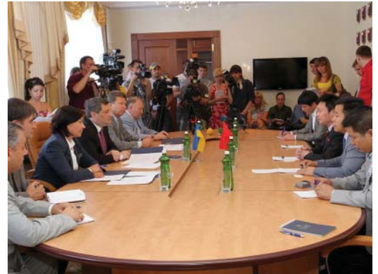
The meeting of the Qitele delegation with the Odesa Oblast leaders at the Odesa Oblast State Administration on June 22, 2011.